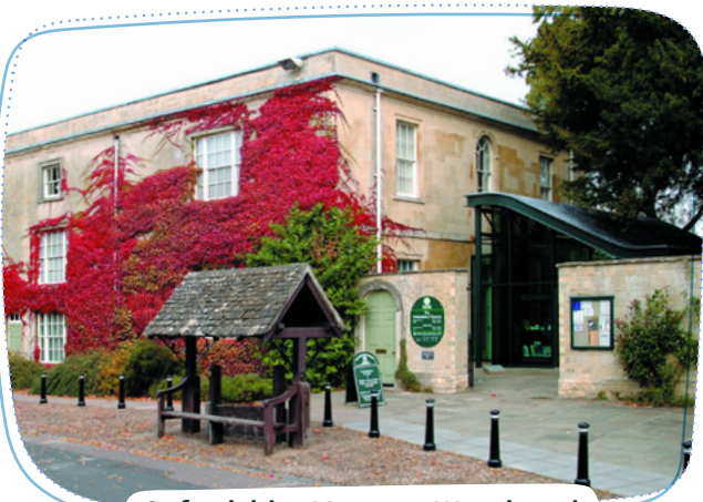
Oxfordshire Museum Woodstock

The council supports the collection, preservation and care of Oxfordshire’s heritage directly through four cultural venues: the Oxfordshire Museum in Woodstock, the Oxfordshire History Centre in Cowley, the Museums Resource Centre in Standlake (housing the reserve collection and outreach service) and Swalcliffe Barn near Banbury. The History Centre is the designated Diocesan Record Office for Oxfordshire, which preserves and makes available records of parishes, the Oxford Archdeaconry and Oxford Diocese.