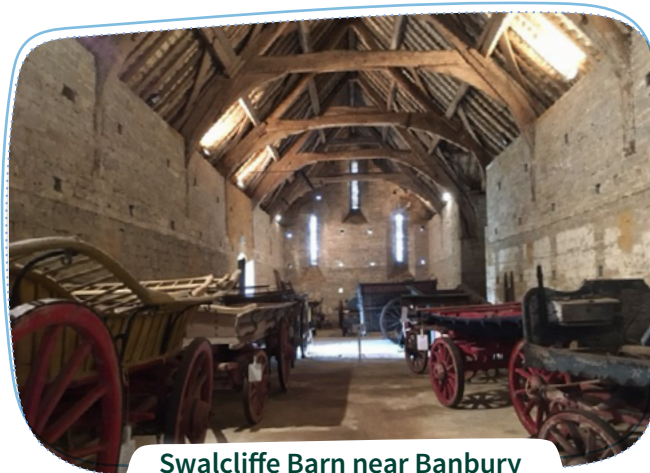
Swalcliffe Barn near Banbury

Through an extensive programme of workshops in schools and at the museum, programmes of informal creative activities for families, and through collection loans to schools, the Museums Service enables children to experience the inspirational power of learning from the ‘real thing’.